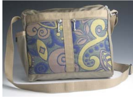
Style #106... $86