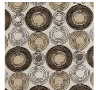
G93 Cream Discs