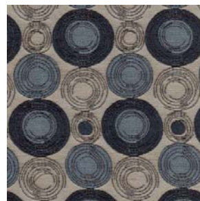
G92 Blue Discs