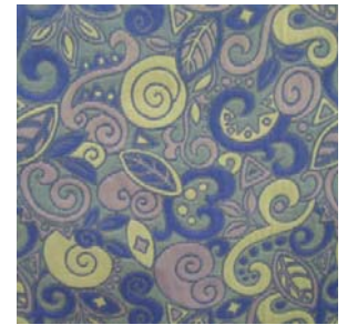
G47 Lavender leaf swirl