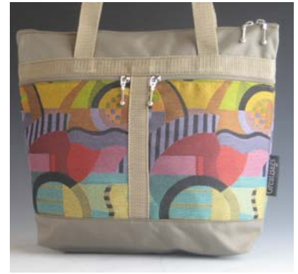
Style #S...$82 Style #L...$95