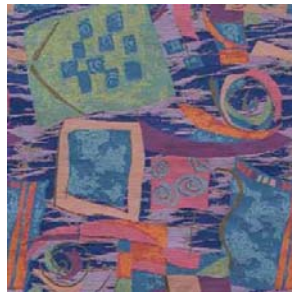
G15 Sgt Pepper Pastel