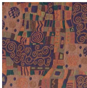
G91 Lavender Klimt