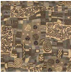
G9 Klimt abstract