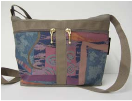
Style #221L...$72 Style #222L...$84