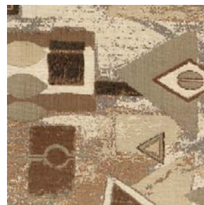
S73 Tan Navaho Abstract