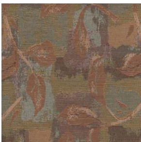
S71 Peach/Mint soft leaves