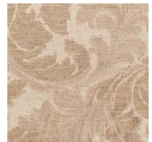
S78 Taupe Brocade