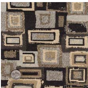
G76 Rothko abstract